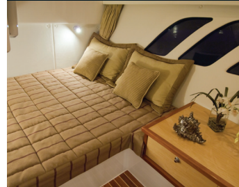
Large master stateroom