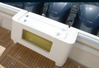
Aft live baitwell