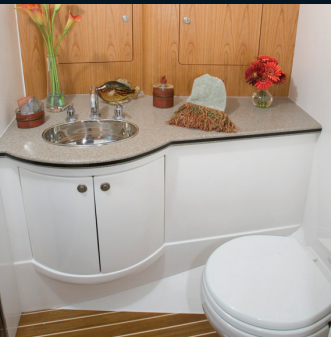
Large private head compartment with separate shower