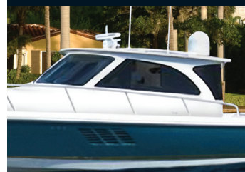
Fiberglass enclosed pilot house with glass power windows