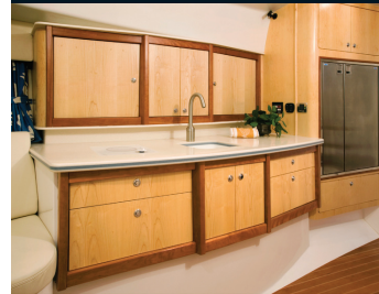
Galley with sink and microwave