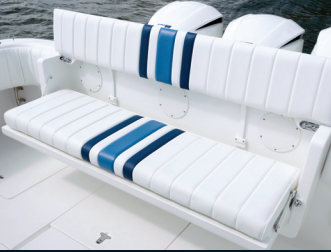
Fiberglass folding rear bench seat