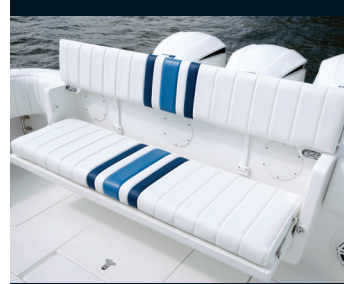
Fiberglass folding rear beach seat