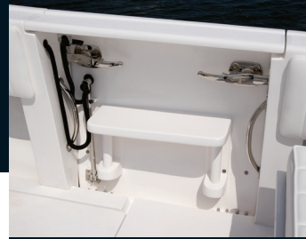
Hullside dive door