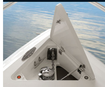
Windlass with remote foot switch