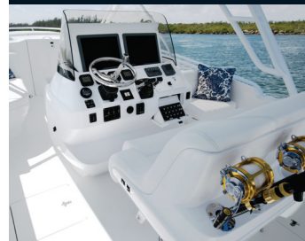
Custom helm seat configurations