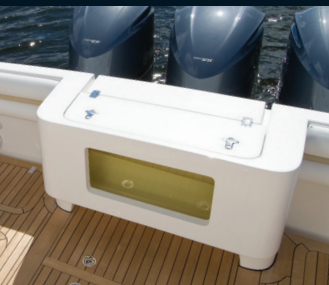
Above deck aft live baitwell