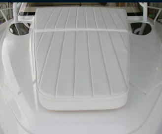
Forward deck cushions