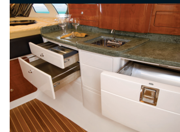
Galley with sink and microwave