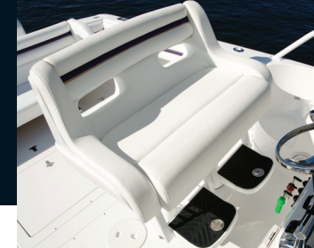
Custom helm seat configurations