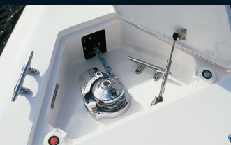
Windlass with remote foot switches