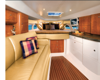
Main salon galley and queen berth