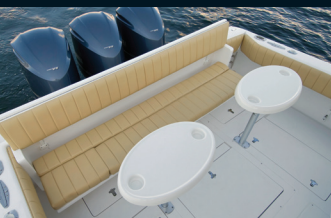
Folding rear bench seat and removable tables