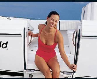
Hullside dive door