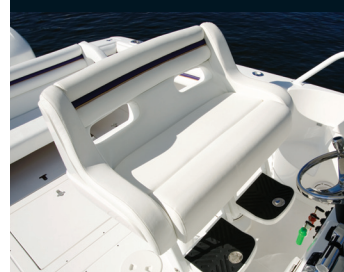
Custom helm seating available