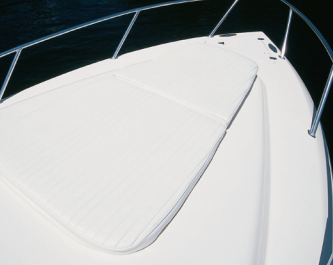
Forward deck padding