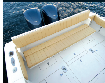
Integrated folding rear bench seat