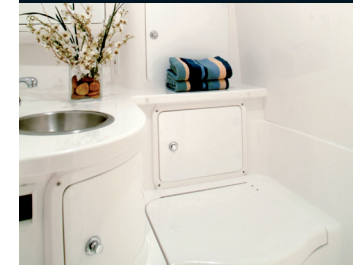
Roomy head with shower, vanity and stainless steel sink