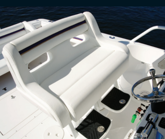
Customizable helm seating