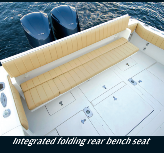
Integrated folding rear bench seat