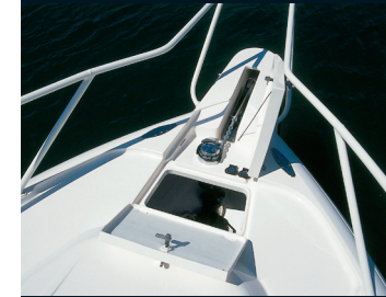
Hidden anchor well and optional windlass allows deck to remain flush until opened