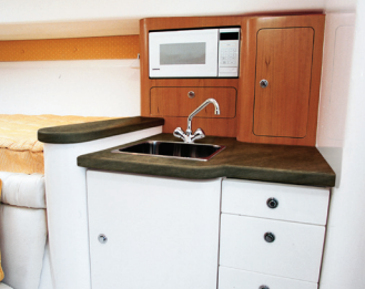
Spacious galley with solid surface countertops, wood veneers and recessed lighting